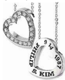
Diamond Heart Your Names & Dates

IN ROMAN NUMERALS! December 11, 1998 XII XI MCMXCVIII