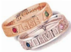
Children's Names & Birthstones

3 DAY RUSH AVAILABLE - 14K GOLD: VALENTINE'S CROSS $390, ANNIVERSARY RING $690 DIAMOND HEART $950, MOTHER'S (UP TO 5 NAMES) $440