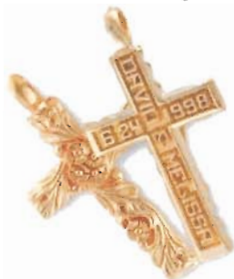
Valentine's Cross Your Names & Dates