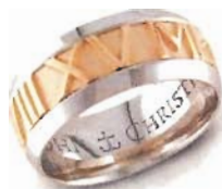
Your Anniversary Date

IN ROMAN NUMERALS! December 11, 1998 XII XI MCMXCVIII